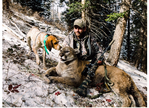
Joe Monchelli