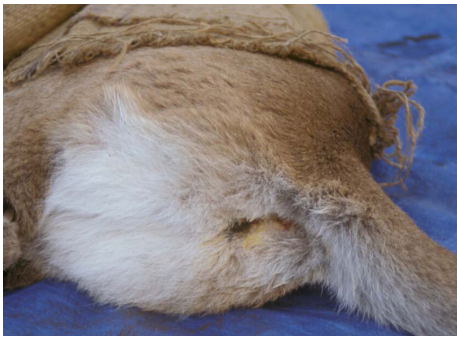
Female mountain lion hindquarters

Tracks also can be good indicators of sex. Adult and large, sub-adult males usually have hind foot plantar (heel) pads more than 2 inches (51 mm) wide. Adult and sub-adult female lions usually have heel pads less than 2 inches wide. Hunters should carry a small ruler or wind-up metal tape to measure tracks.