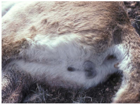
Male mountain lion hindquarters

CPW.STATE.CO.US/ MOUNTAINLIONEXAM FOR MORE INFORMATION